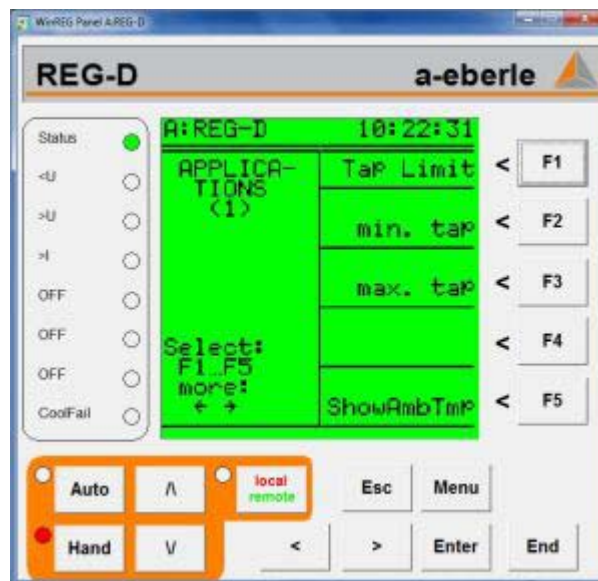
Figure 3. Example of REG-D customised screen for user defined settings, which can be developed using H-Code.

*Current threshold values are specified and adjustable in the H-Code.