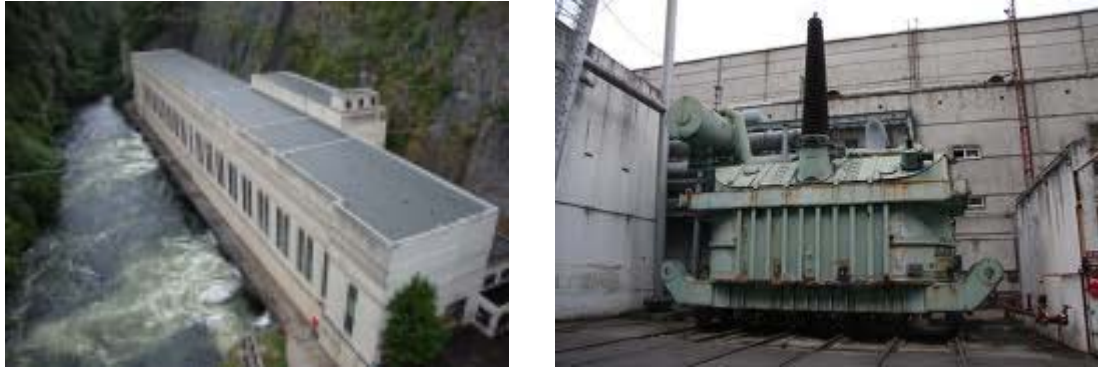
Figure 4. Advanced Transformer Cooling Application.

A future enhancement being worked on is a request to provide a separate grading curve on the Winding Temperature Indicator (WTI) based on the transformer running without pumps.