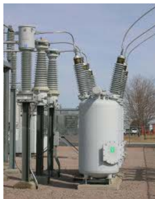
Figure 2. Voltage regulator monitors breaker status.

For this particular utility however the transformer breakers were old and the auxiliary contacts considered unreliable. In order to ensure that there was certainty around the connection of a transformer in its paralleling group, an H-Code program was written to confirm breaker status by monitoring the load current on it.